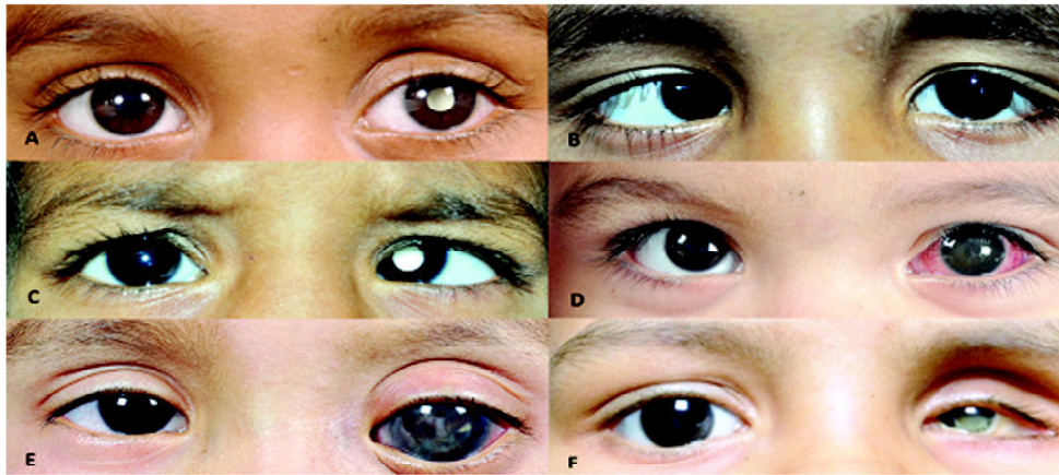
Figure 1: Presenting features of retinoblastoma